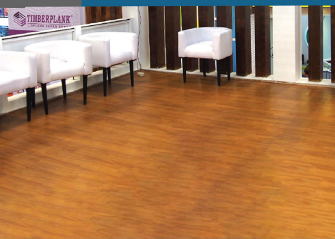
HERA DECK MAHONI